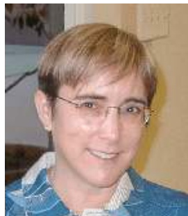
Nancy Wahl Program